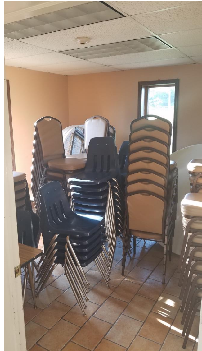
Grade PreK - 1