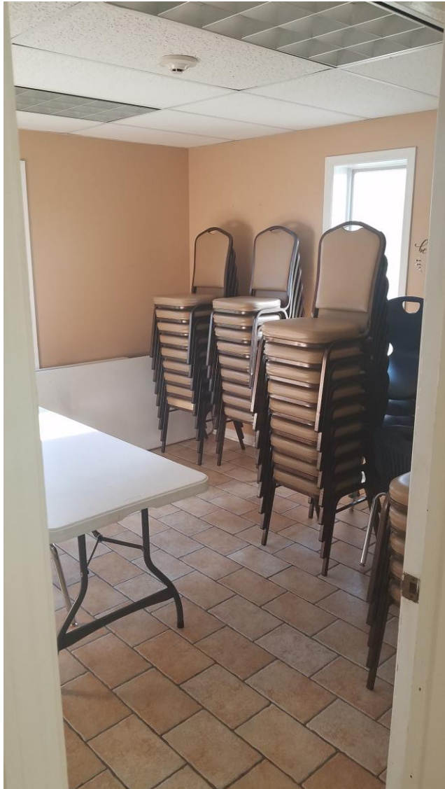
Grades 6, 7, 8